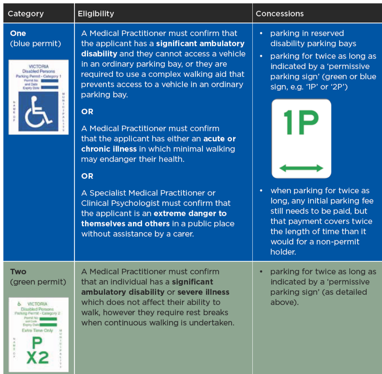
Table 1: Categories of disability parking permits